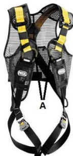
Safety harness for training (PETZL)